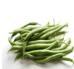
10. green beans